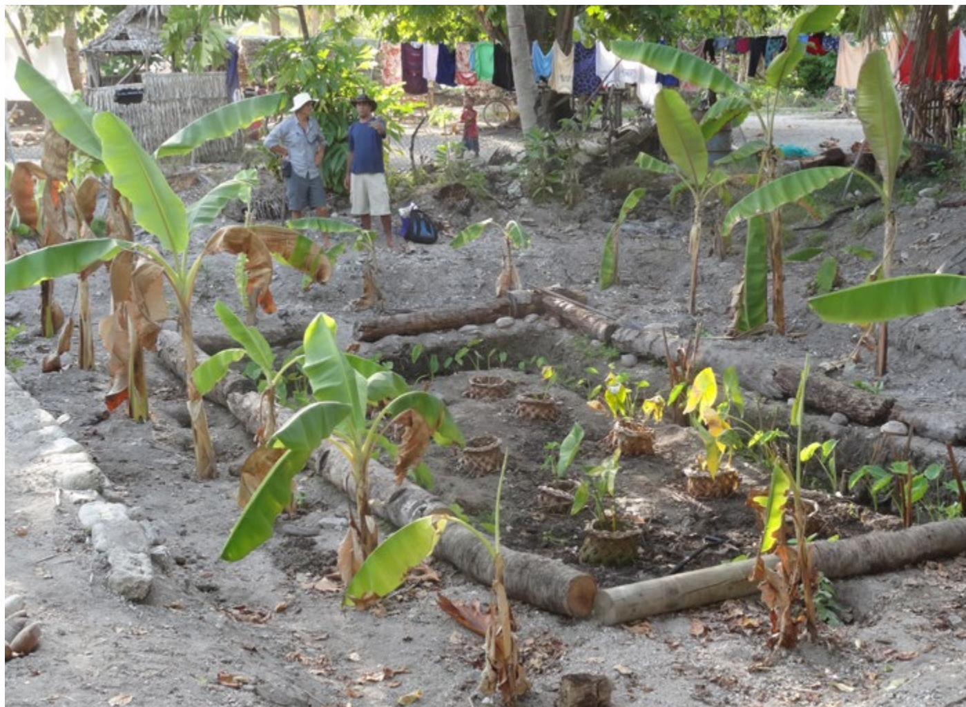
Babai food garden under development on Abemama Island, Kiribati in February 2017

How better to grow these crops than with traditional Giant swamp taro pits? ( Cyrtosperma merkusii , called babai in Kiribati and pulaka in Tuvalu). These have been historically dug by hand down to the water table. Many of these pits are now neglected but they provide a strong connection to both culture and underground water.